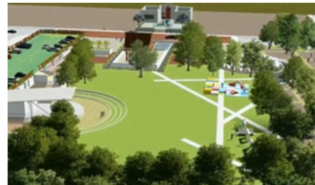
Fig. 5. Pedestrian network.