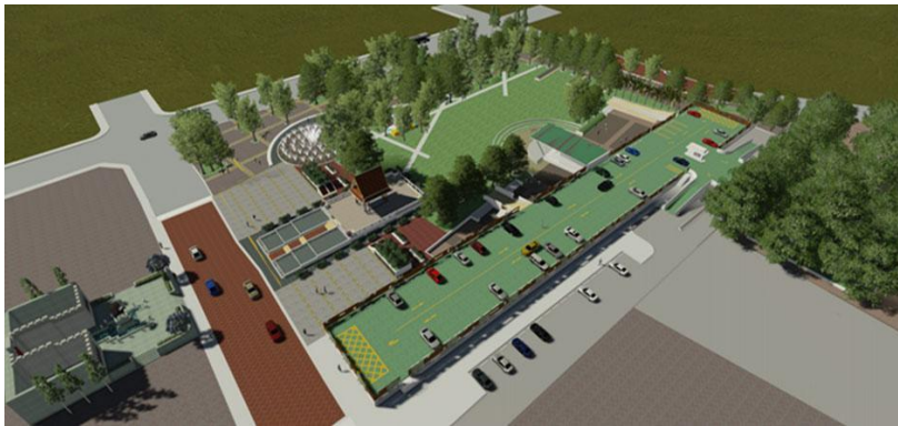
Fig. 8. Overall view of PCP.

Fig. 8 illustrates the overall view of phase I. The urban park has undergone the construction since 2016. The construction of this urban park is divided into two phrases. Phase I covers the area of circular fountain and Sri Tala Pirom Pavilion, which is built to celebrate King Rama X. Phase II features the great lawn, play areas, an open-air theatre and the secluded garden.