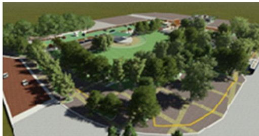
Fig. 4. Green-roofed theatre and the great lawn.