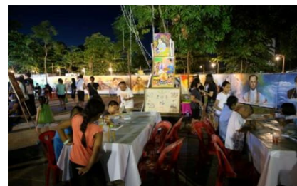
Fig. 7. Promenade as a venue for Art exhibition to honor the Late King.

Importantly, the Great Lawn, amphitheater, and even the promenade will serve as a place for people to celebrate cultural events and have memorable moments. Fig. 7 illustrates the art exhibition held in the promenade of PCP as the tribute for the late King Bhumibol Adulyadej (Rama IX) during 1 August - 31 October 2017. Apart from the art exhibition, mini-concert and food stalls were set up to attract a large number of visitors. It demonstrates that this extensive space of the promenade could be used to facilitate large-scaled events which will bring life to the city and memorable experience to urban residents.