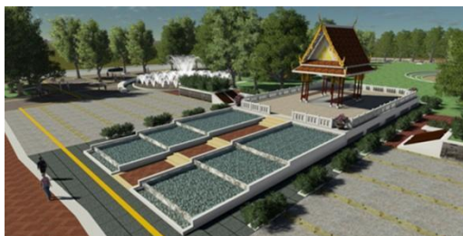
Fig. 6. Sri Tala Pirom Pavilion.