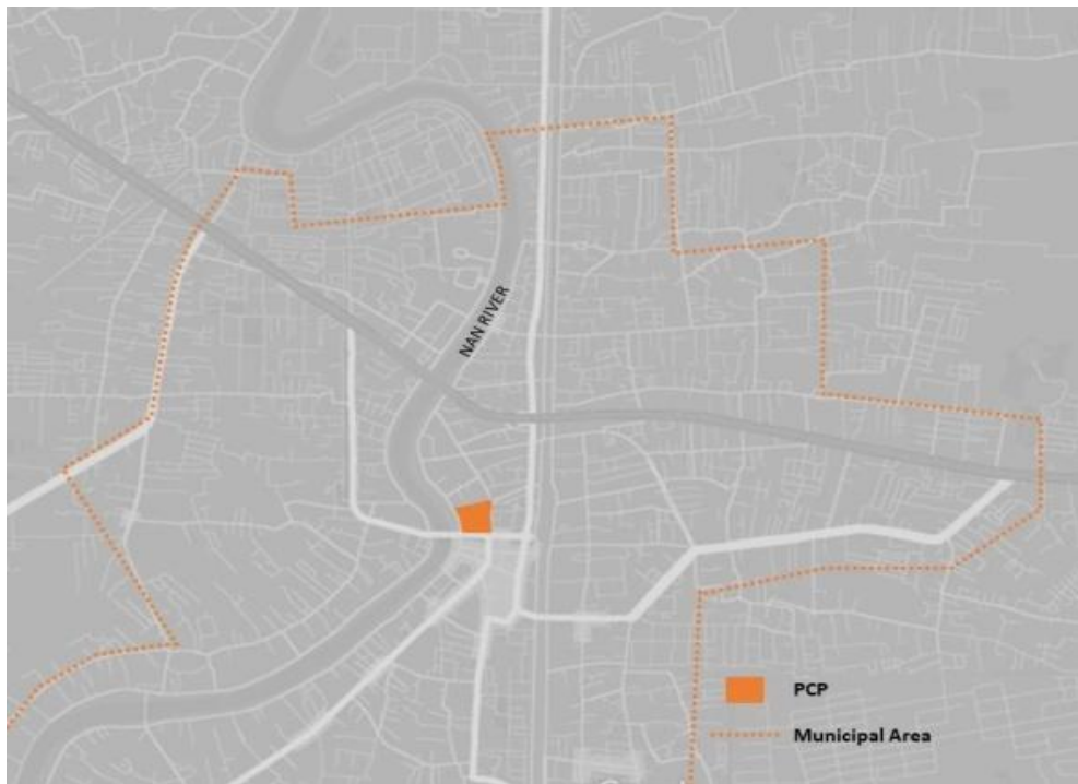
Fig. 1. Map of Phitsanulok City.

The latest UGS project is Phitsanulok Central Park (PCP) as the extension of Chom-Nan Waterfront. Located in the city center and surrounded by public buildings, commercial districts and historically significant monuments ( Fig. 1 ), this new urban park is envisioned as the new city landmark and the important open space for urban residents and visitors to celebrate public events and enjoy greeneries. To attract a wide range of users, the accessibility and a variety of facilities are the critical issues for the urban park development. Historic importance of the site and its surroundings needs to be unveiled and echoed to construct place identity. Along with social values, this urban park should exemplify greening initiatives to raise people's awareness in environmental sustainability. In addition, the involvement of stakeholders in the early planning process to make decision on the PCP's elements is essential to ensure that PCP will become an engaging, inclusive and meaningful urban park.