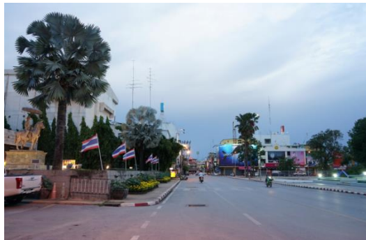
Fig. 6. A street in front of Chao Phraya Chakri Monument.

Apart from being a vital natural environment in the area, the Nan River in the past was a lifeline and a center of all activities. It, therefore, constructs to people's collective memory. With this quality, the river could be a key part to be considered in order to make a linkage between old and new. Once connected to the river, the Buddhist temples are now separated from the waterway, whilst the new public spaces are instead linked to the river and use it to serve their modern functions. Why cannot the river link to both new and historic structures and then serve both environmental and memorial functions? Modern developments bring the river into their uses, but why do not bring in the city memory as well? To consider the river as a beginning point, the connection between old and new may be created to serve both people's activities and memories.