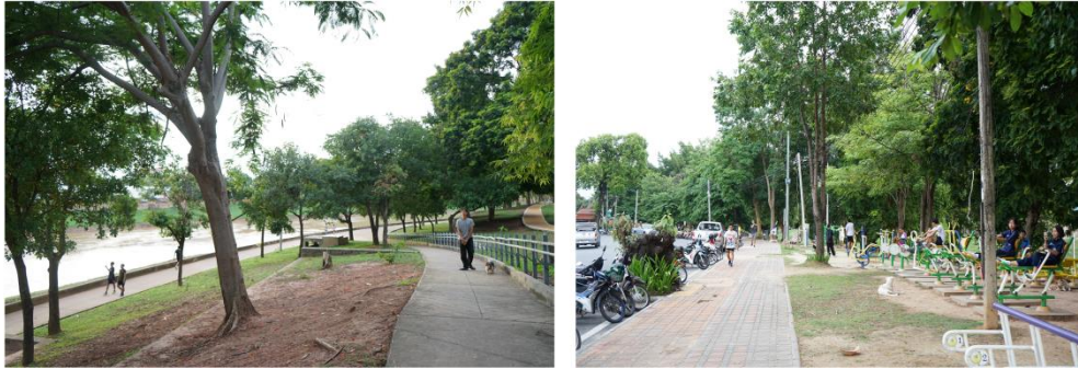
Fig. 3. Chom Nan Park (phase 1).