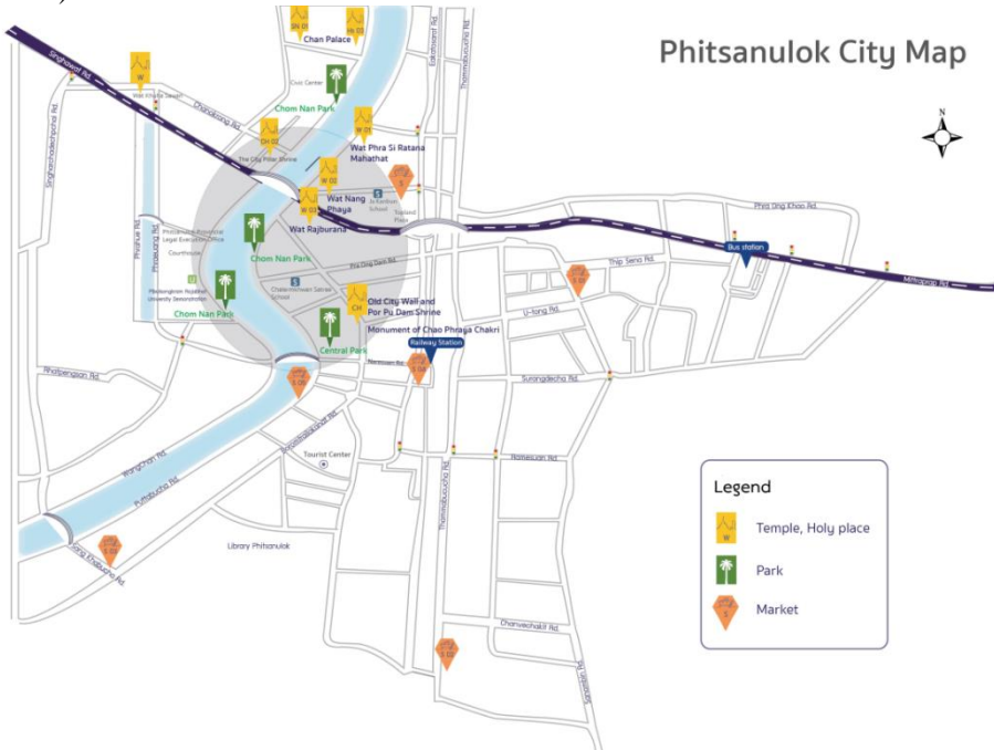
Fig. 1. A map of Phitsanulok's urban quarter.

is planned to be a new public park that links to the existing waterfront public space (Chom Nan Park).