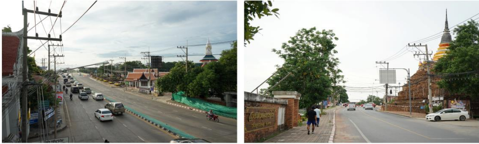
Fig. 5. A main road with Wat Rajburana on one side and Wat Phra Si Ratana Mahathat and Wat Nang Phaya on the other side (left) and a street in front of Wat Rajburana (right).