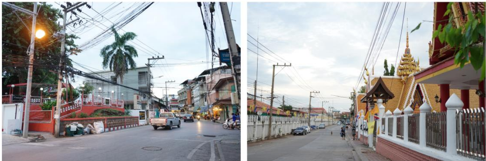
Fig. 7. Rigid boundaries of historic places.

More than a design of crosswalks, pedestrian spaces should be taken into account to make a link between the historic places and modern urban parks. Control of motor traffic should be introduced to put pedestrians on the first priority in space and allow them to safely and freely engage with all activities without any interruption.