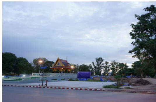
Fig. 4. Phitsanulok's Central Park (under construction).

Regarding historic places, Phitsanulok as a historic city is physically illustrated by the structural remains from its past. Its historic quarter is right at the heart of the city. Located in the studied area are three Buddhist temples, a royal monument, and the remains of the old city walls ( Fig. 2 ). Although other several historic places are also in the vicinity, the studied area is selected because it encompasses the undergoing project of city development. A combination of old and new structural elements makes the study up to date and, therefore, its result could possibly be applied to future development plan to approach an extensive planning.