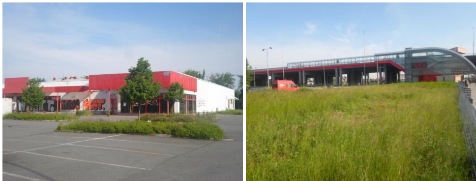
Fig. 6: Examples of brownfields sites in Svinov – an abandoned shopping hobby market (left) and empty site after the demolition of a mall (plato - right).