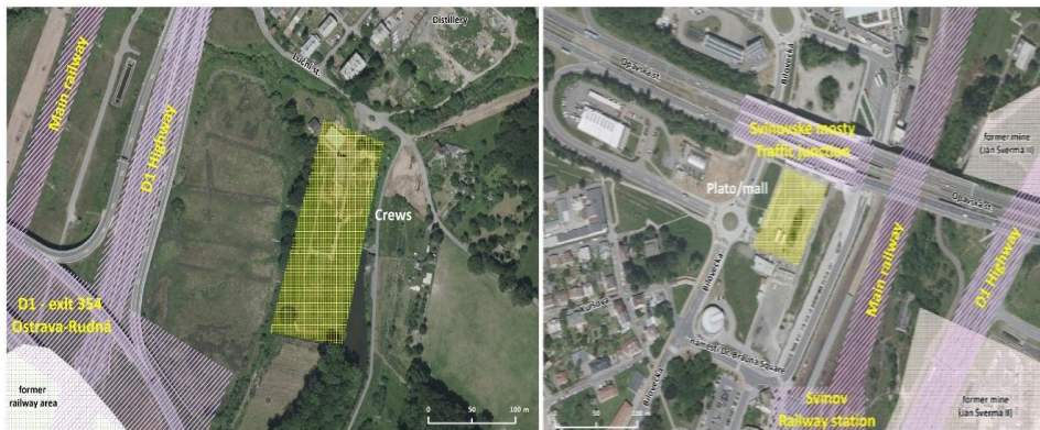
Fig. 4: Location and basic relations in neighbourhoods of former crews (left) and empty mall (plato - right) in Svinov.