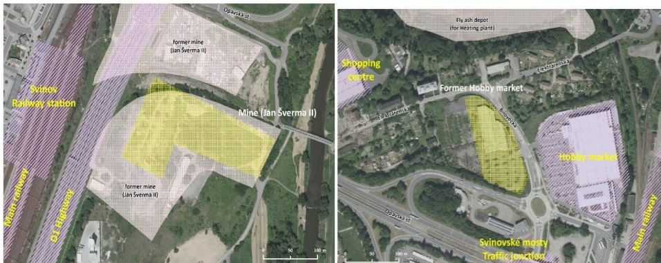
Fig. 3: Location and basic relations in neighbourhoods of a former mine (Jan Šverma II - left) and former hobby market (right) in Svinov.

The results achieved by the presented research might be divided into two parts. The first part was focused on brownfields regeneration from the general perspective, while the second part was devoted to an evaluation of particular brownfields sites in Svinov (5 model sites mentioned and described above – see Fig. 3-5 for more specific relations in their neighbourhoods).