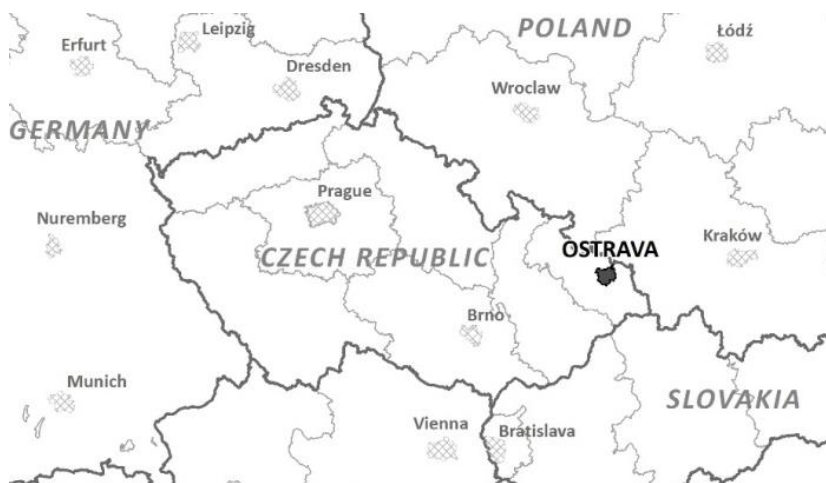
Fig. 1: Location of Ostrava in the Central Europe

The selection of research design of the presented study has been inspired by a set of already published studies that focus on the perception of urban spaces and urban brownfields in the western part of Europe, USA, Canada (e.g. Coffin & Shepherd, 1998; De Sousa, 2000; Eiser et al., 2007) and in the post-communist countries of the East-Central Europe (e.g. Cobârzan, 2007; Krzysztofik, Kantor-Pietraga & Spórna 2012; Filip and Cocean, 2012; Duží and Jakubínský, 2013; Kunc et al., 2014a, 2014b;). The area of Svinov (one of the city parts of Ostrava – see Fig. 1 for geographical context) has been selected for the research due to its frequent occurrence of brownfields owing to its rich industrial history (see below). In the initial phases of the research a thematic retrieval of literature, strategies and concepts of brownfields regeneration and its perception was carried out. A database of existing brownfields in Svinov has been developed on the basis of a wider brownfields database of the entire city of Ostrava in 2010 ( https://dycham.ostrava.cz/brownfields/brownfields.html ), which was supplemented by a detailed field research to make the existing database as recent as possible (early months of 2014).