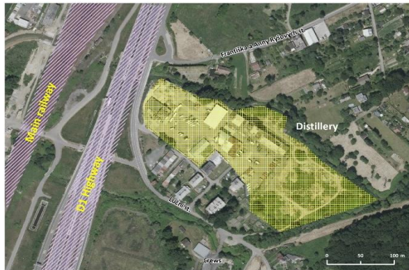
Fig. 5: Location and basic relations in neighbourhoods of a former distillery in Svinov