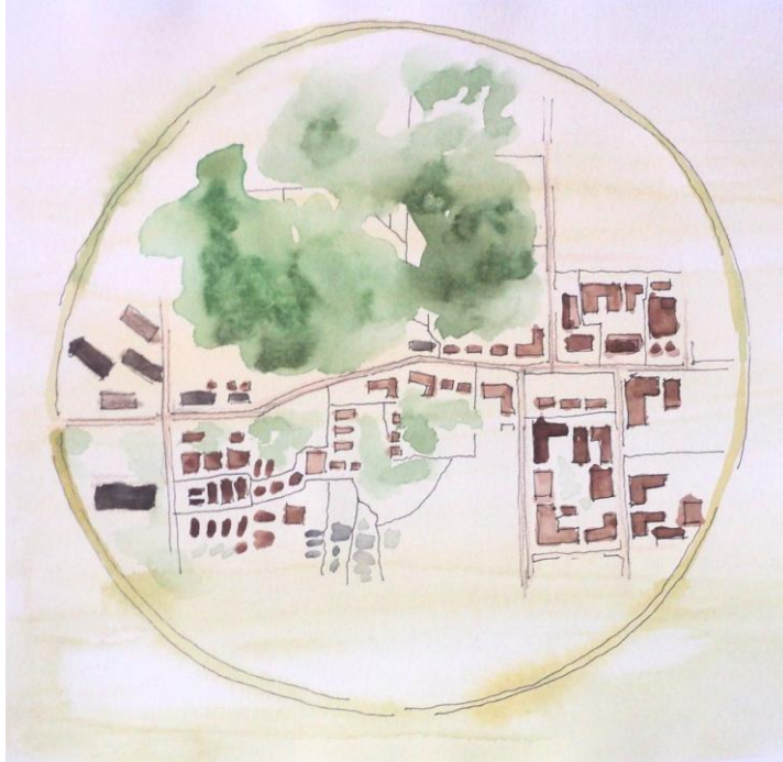
Fig. 7 Ioana Andreea Patrut, graphic exercise, superimposing daily basis experience in Cluj over the shape and form of medieval representation known as “mappamundi”; pencils and watercolor on paper, time – 1 hour, 2014.