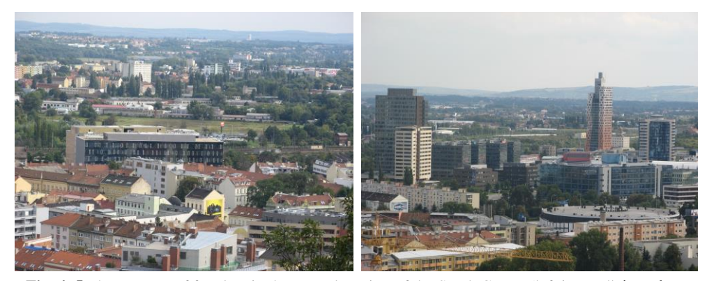
Fig. 4, 5 The contrast of free lots in the central section of the South Centre (left image, "view photo 4") and the construction of a new administrative and business centre in the south-western margin (right image, "view photo 5"), as of September 2013.

Note: The environment of both images is in reality contiguous, divided "only" by the railway tracks.