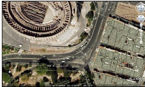
Fig. 6 Result of the fitting of the cadastral sheet on Google Earth. Colosseum and the adjacent blocks fit well.