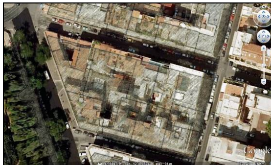
Fig. 7 Higher scale magnification of the fitted sheet: block outlines fit well at the ground level.