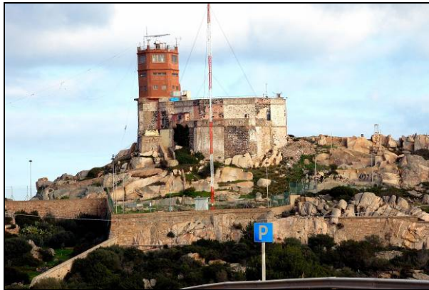
Fig. 4 The Guardia Vecchia near La Maddalena, Isola Maddalena at the northeast coast of Sardinia, the fundamental point of the Sardinian triangulation.

The present paper aims to estimate to error of this extension of that system, and to describe the parameters of the other systems for GIS applications, thus offering a tool for future, higher-accuracy methods to fit the cadastral maps of souther Italy and Sardinia to modern grids.