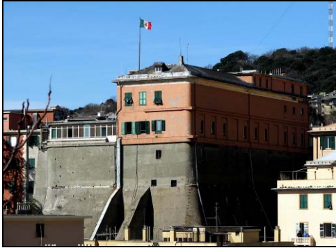
Fig. 2 The Istituto Idrografico della Marina in Genova, with the fundamental point of the Genova1902 datum on the roof terrace of it.