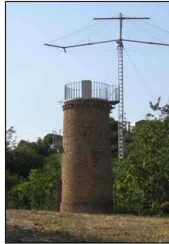
Fig. 3 The tower of Monte Mario, fundamental point of the old and the 1940 Monte Mario datum